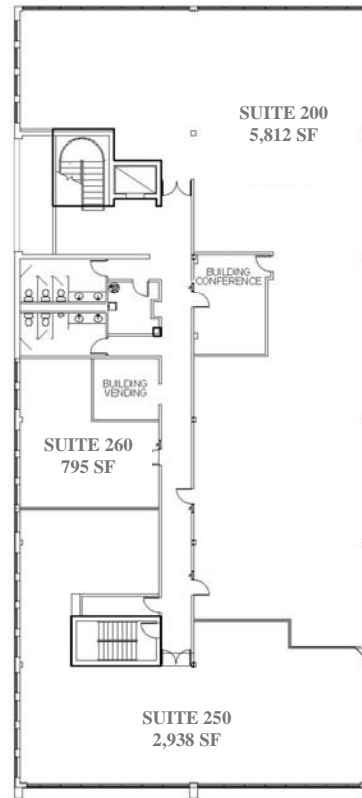
2 STACKING PLAN SECOND FLOOR